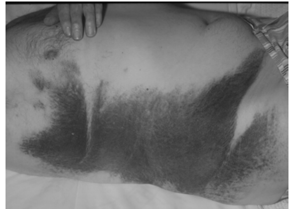
Figure 1: Extensive purpura over the flanks of a 62-year-old man with acquired hemophilia.

the hallmark of severe congenital hemophilia, this is unusual in acquired hemophilia where the principal manifestations are bleeding into skin (purpura) and soft tissues. Figures 1 and 2 illustrate typical examples of extensive purpura due to acquired hemophilia.